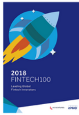
KPMG-H2 Ventures Report