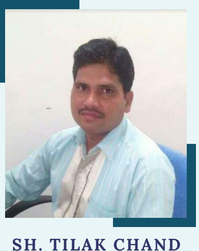
SH. TILAK CHAND University Information Resource Centre