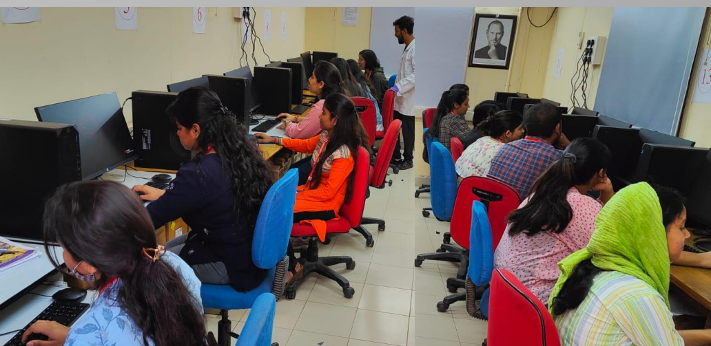
High End GPU enabled workstations with faster computing power

www.ipu.ac.in , http://www.ipu.ac.in/ceps/index.php , ipu.admissions.nic.in